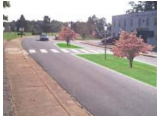
Remove Power lines