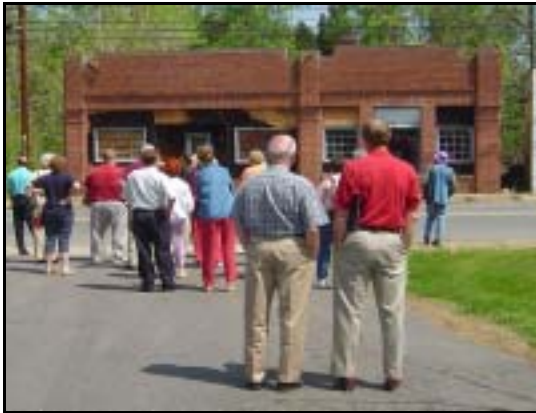
Exercise Three: Walking Tour