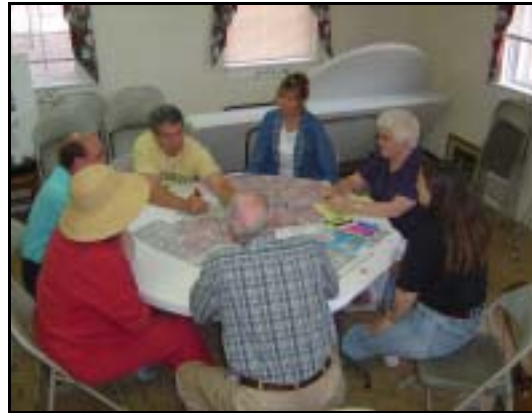
Exercise Four: Drawing and Mapping