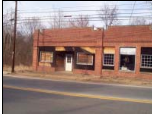
Vacant building, Fork Union

Addressing water and sewer concerns will be necessary in order to rehabilitate existing structures and allow for additional economic development.