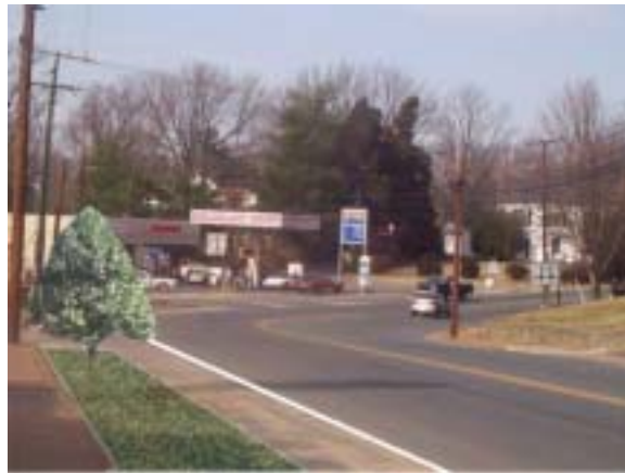
Add grassy strip with trees or shrubs to fill unused space and narrow feel of road without affecting travel lanes. May be space for bicycle lanes as well.