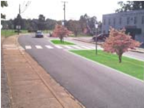
Add streetlights to median