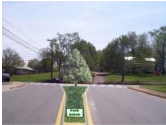
View from west