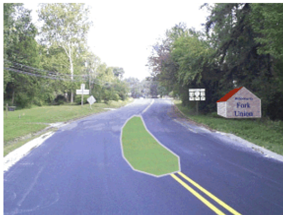
Add entry median with welcome sign