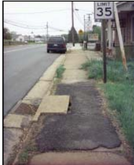
Sidewalk along Route 15, downtown Fork Union