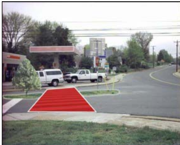
Add grassy median with trees or shrubs and brick crosswalk