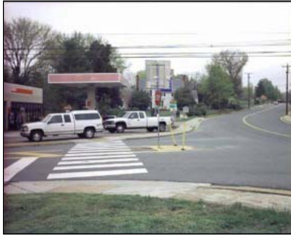
Existing area is painted out asphalt