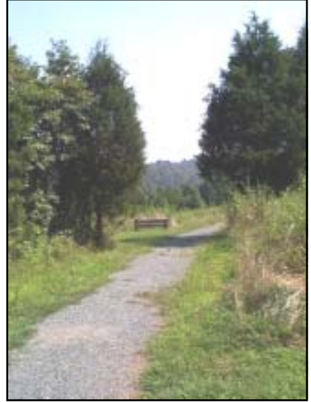
Fluvanna Heritage Trail