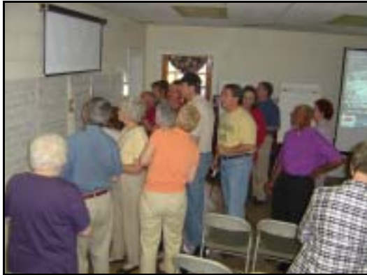
Exercise One: Visions and Values

elements and movements around the room. Special care was taken to assure the workshop setting was welcoming, encouraged participants to be at ease with one another, invited the thoughtful consideration of the questions, ideas and tasks, and allowed for a degree of informality and social interaction. Results of the exercises can be found in the appendix.