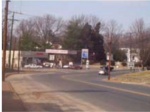
Existing shows underused section of wide road