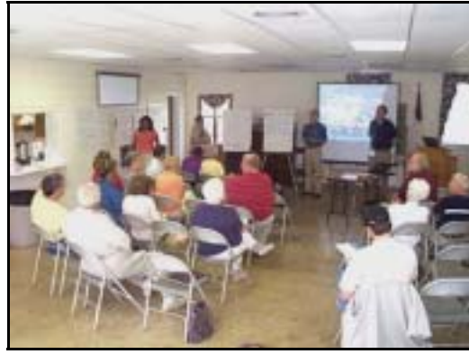
Exercise Two: Themes and Priorities