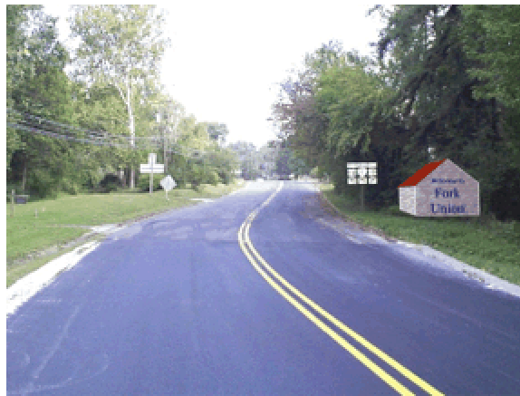
Paint pumphouse and clear vegetation