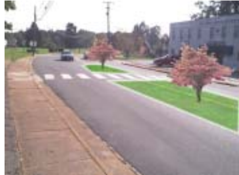
Add median with trees