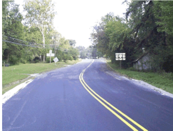
Existing entrance at creek