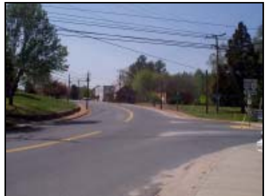
Fork Union intersection