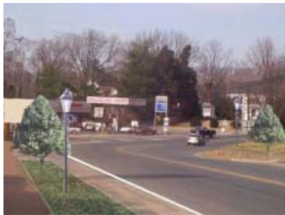
Bury utilities and add street lights for extra beauty