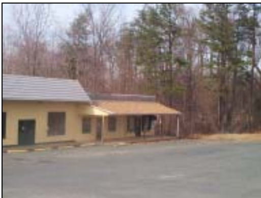
Village Shopping Center Fork Union