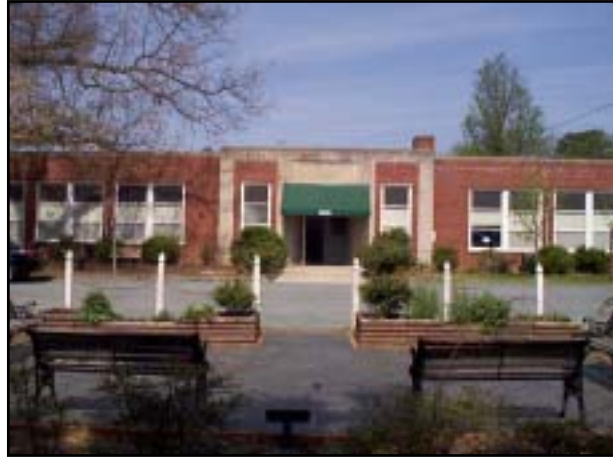
Fork Union Community Center